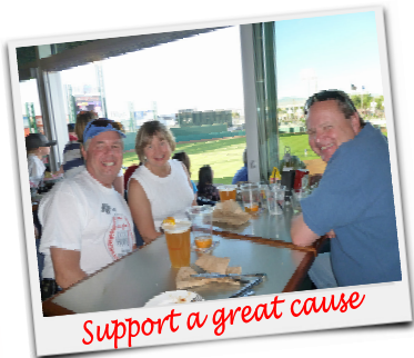
Support a great cause

In April 2011, HOPES hosted the first annual Dining Out for Life® Northern Nevada-