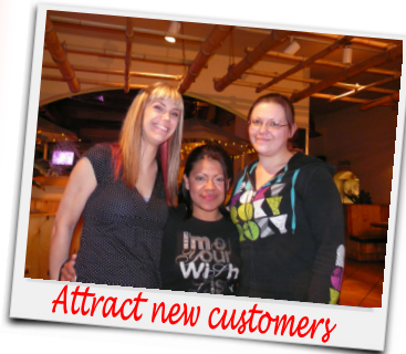
Attract new customers

With an estimated 1,711,990 impressions Dining Out for Life® is an amazing opportunity for businesses. Enclosed you'll find detailed information regarding Dining Out for Life® 2012.