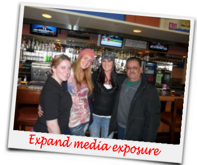
Expand media exposure

Join HOPES and an estimated 75 local restaurants, bars and shops for the second annual Dining Out for Life® (DOFL) Northern Nevada on Thursday, April 26, 2012 . The goal is to raise as much money for the regional leader in HIV/AIDS service and prevention programs, Northern Nevada HOPES .