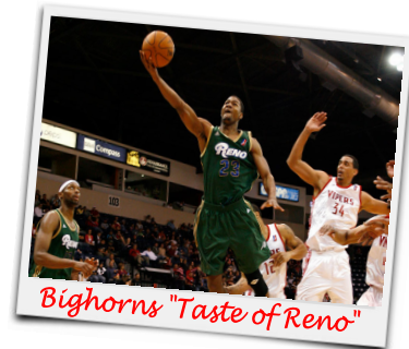
Bighorns "Taste of Reno"

It all starts with the kickoff event- "Taste of Reno" presented by the Reno Bighorns at 7pm on Friday, March 16. In addition to enjoying the Reno-Dakota Wizards game, fans will enjoy food samplers from select DOFL participating restaurants/shops.